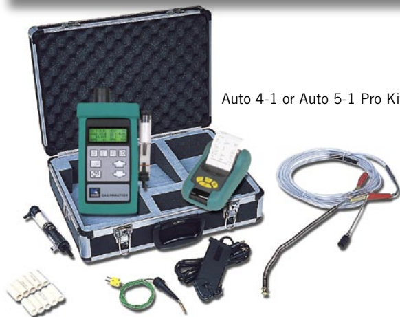
Auto 4-1 or Auto 5-1 Pro Kit