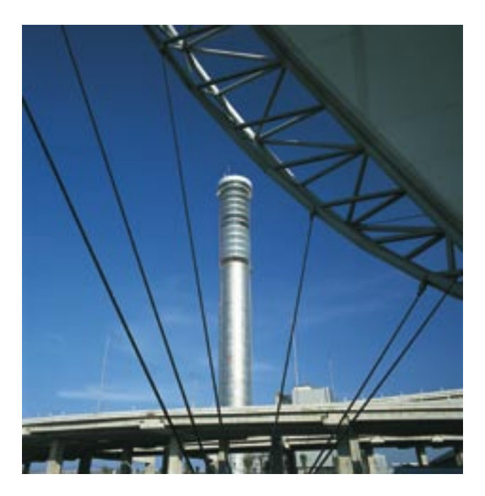
The Second Bangkok International Airport (SBIA) has the world's tallest control tower (132.2 m).

Unique to the Vaisala Low Level Windshear Alert System (LLWAS) is the usage of accurate and maintenance-free ultrasonic wind sensors. The sensor is ideally suitable for LLWAS where accuracy is crucial and masts are tall, making regular maintenance rather difficult.