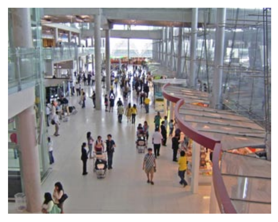
The futuristic design has drawn hundreds of thousands of sightseers to the SBIA airport.