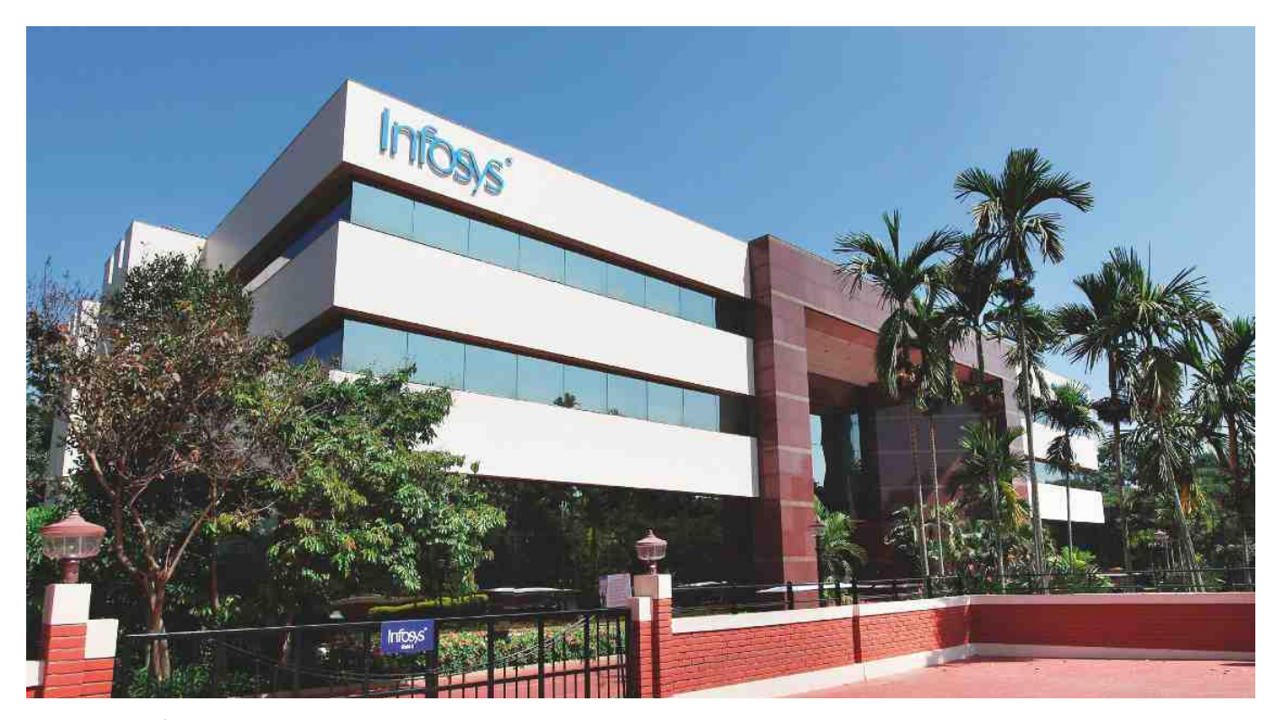
Infosys Head Office in Bengaluru, india.

Infosys is the second largest Indian IT consulting company with 200,000 plus employees and revenue of over USD 10 billion. With headquarters in Bengaluru the company has its development centers in over 16 locations pan India and one campus in China. Currently Infosys is using Vaisala's HVAC sensors in all its projects.