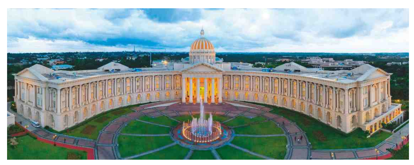
Infosys Global Education Center (GEC) in Mysore Campus, Mysore, India.

employees. IEQ has a direct impact on employee productivity.