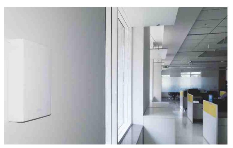
HVAC sensor installation in one of Infosys office buildings in Bangalore campus, Banagalore, India.